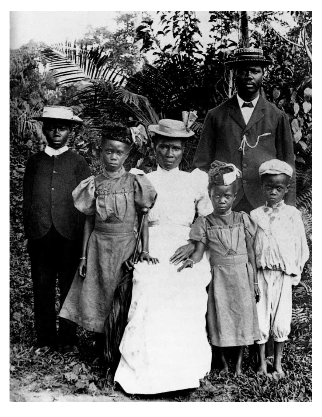
Photograph taken in 1898 of an African family who lived with Christian missionaries who wanted to show that Africans could be westernised. 0470/04/O/N/04